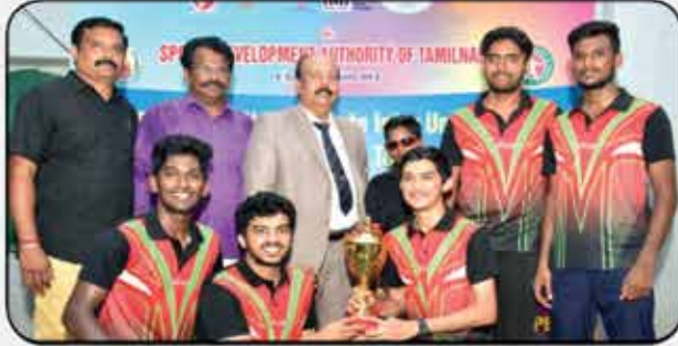
Table Tennis Competitions Conducted

With financial assistance of the Sports Development Authority of Tamil Nadu, Chennai, Alagappa University's Directorate of Physical Education conducted Table Tennis competitions for men and women on 30.05.2019 and 31.05.2019 at Alagappa University Physical Education College. Eight teams from Tamil Nadu Universities participated in the two-day competitions.